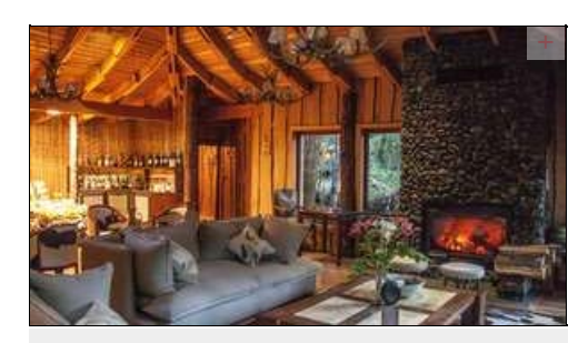
Intimate lodging and dining is the trademark of Nawelpi Lodge (Puma Lodge), at Huilo Huilo, Chile.

trails, the Rio Fuy and Lake Pirehueico promote hiking, fishing, kayaking, easy and risky whitewater rafting, birding and horseback riding.