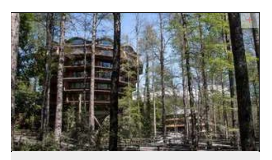
The Hotel Nothofagus — so-named for a genus of southern beech trees — is the largest of Huilo Huilo's four hotels, ... Read More

If any doubt remains, Huilo Huilo's tourist map, a "Where's Waldo" visitor guide, proves the point. Done up in comic book colors and crowded with cartoon figures, it's chock-a-block with visitor services, nature trails, ski slopes, trout streams and hotels built to blend into the undergrowth.